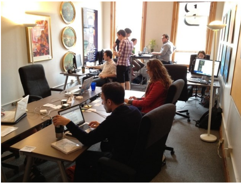
Photo of an office in Busy Coworking located above the Chait Galleries in downtown Iowa City.

Encouraging entrepreneurship and small start-up businesses is an important economic goal of the Comprehensive Plan. To that end the City of Iowa City has provided support for two coworking offices: Busy Coworking and the Iowa City Area Development Group's IC Colab. For a membership fee, entrepreneurs get access to offices, conference rooms, wi-fi, printing, and photocopying on an as-needed basis. Coworking also provides unique opportunities for networking and collaboration between businesses.