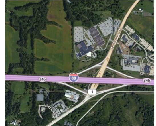
Aerial view of the Moss Ridge Development property, located to the west of the NCS Pearson campus.

The Moss Ridge Development is a proposed 172-acre class A office park to be located west of NCS Pearson. The will expand Iowa City's Office Research Park zone, adding to a major employment center at the Interstate 80 and Highway 1 intersection.