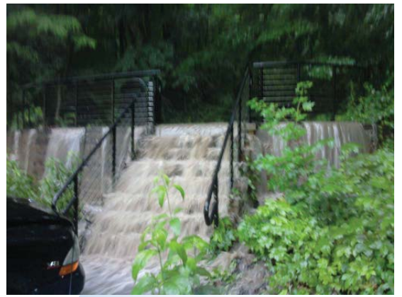
Flash flooding behind the University of Iowa's Mayflower Residence Hall, June, 2010

Increase storage – The team is looking for opportunities to store local storm water runoff in nearby wetlands and open spaces. During locally heavy rain events, this would give the water a place to drain to and promote infiltration. During historic floods, these areas would be under water, and would not provide any significant storage.