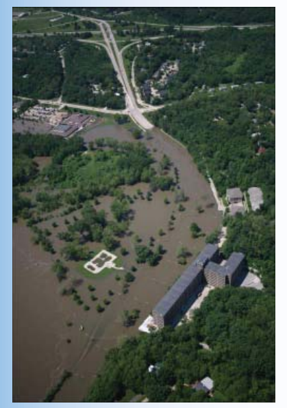
2008 Flood in Iowa City

Getting it right: After the 2008 flood, a new HEC-RAS Iowa River model was developed, stretching from the Coralville Dam to the southern city limits. Output was calibrated with actual data gathered during the flood and new technology was used to obtain accurate cross-sections of the river and floodplain. This model is being updated by the City of Iowa City along with the City of Coralville and the University of Iowa to incorporate all proposed and constructed flood mitigation projects to determine their aggregate effects during flood events.