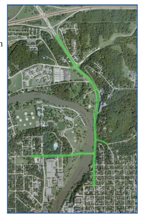
Iowa City Gateway Study Area

Construction is anticipated to begin following the conclusion of Phase 2 and take approximately two construction seasons.