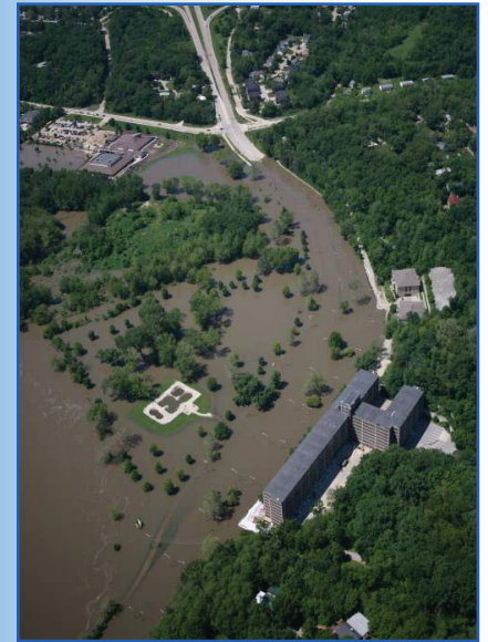
2008 Flooding in Iowa City

Dubuque Street serves as Iowa City's main entrance and key gateway into the community for residents and visitors. It parallels the Iowa River, and carries more