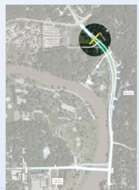
Looking south, near Taft Speedway