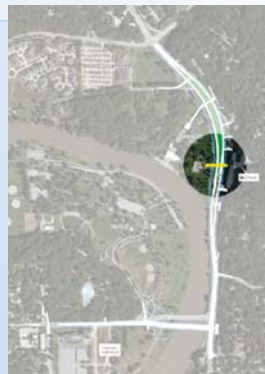
Looking south, near Mayflower Residence Hall