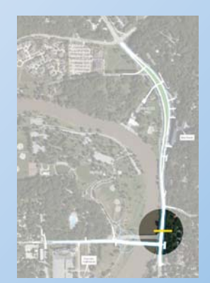
Looking south, near Park Road